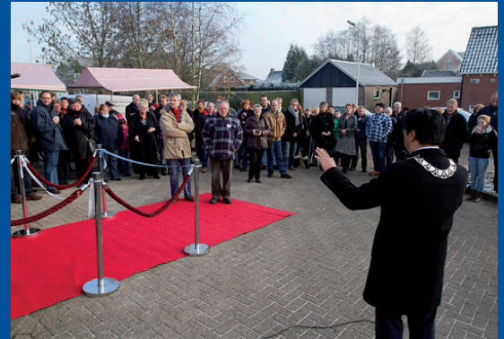
Opening Virtual Office

The mayor and the alderman of the Municipality of Achtkarspelen have recently opened the first support station and virtual office in the village of Twijzelerheide. Within the support station multiple activities in benefit of the inhabitants are housed. Via a screen inhabitants enter the virtual office and are capable to manage their businesses with the municipality, the police, and other public services via an online connection. The virtual office at Twijzelerheide is a pilot which is hosted and housed at the support station.