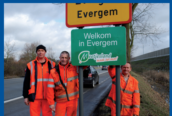
Public workers posted the welcome signs