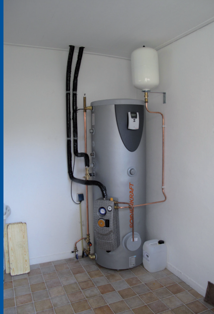
Solar water heating

ROC Friese Poort, a school for secondary education, participates in the Vital Rural Area project to enhance networks of knowledge and therewith strengthen small and medium enterprises (SMEs) in the technical sector.