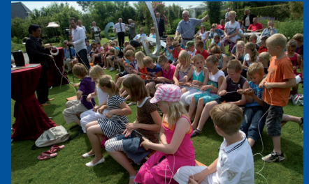
Children discovering glass fiber cables

In Vejen, Denmark, a glass fiber and broadband infrastructure has already been realized and successfully put to practice. Schools benefit from centralized services and improve their education by using ICT. Achtkarspelen, one of the NOFA municipalities in The Netherlands, is taking on this idea. 22 primary schools in the region have started a pilot project to create a glass fiber network. During the pilot in Achtkarspelen children discuss a subject in English using skype and digiboard. The two municipalities intent to share information, knowledge, skills and techniques on this topic. Furthermore, the Rabadeira primary school in Oleiros Spain is interested in participation as well. Cooperation between 3 primary schools is now being investigated.