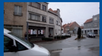
Ugly spot in West Flanders

Whilst the name suggests differently, 'Ugly Spots' is a successful project carried out by Intercommunale Leiedal. The project draws attention to the ugly spots and offers creative thinkers an opportunity to change these. The aim is to increase the popularity of the region and to improve the quality of the public space.