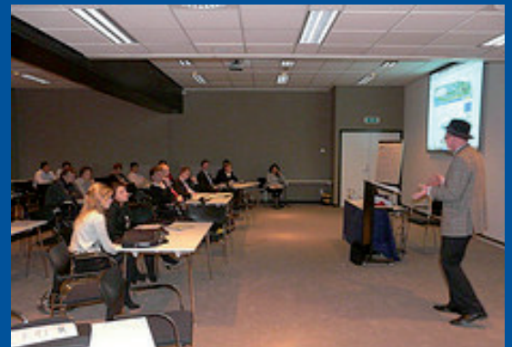
Students working on the project assignment